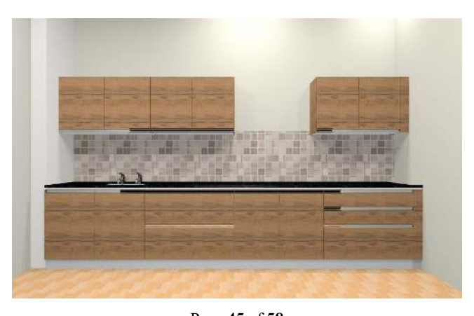
Page 45 of 58